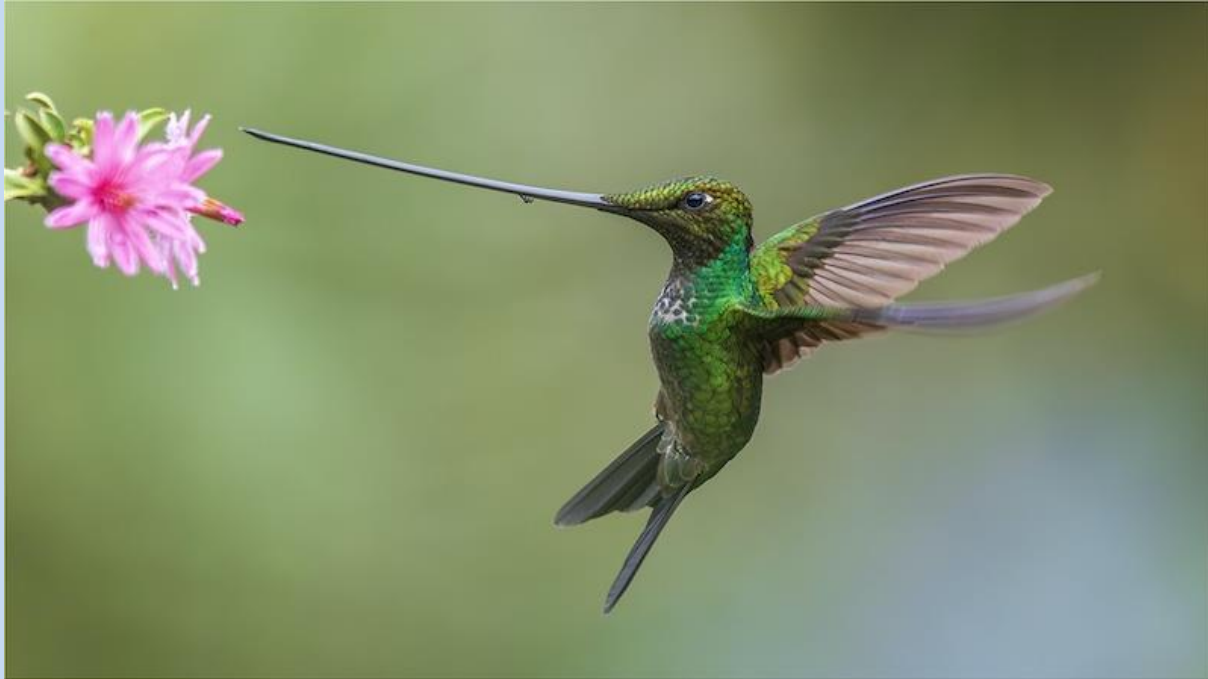
Dance of the Swordbill

PSSA GOLD MEDAL FOR THE BEST NATURE IMAGE