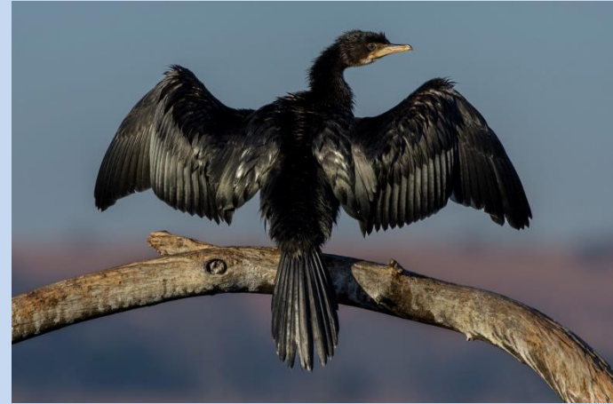
Winner – Wildlife/Nature Jacques Blignaut - Drip dry in the morning sun