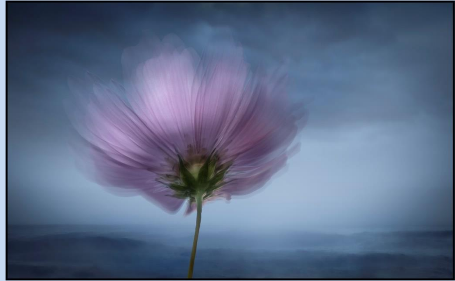
Ursula Baumann Fading like a flower