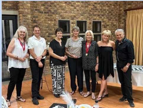
The 2024 committee